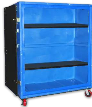
One Lower Shelf With 32" Upper Level and 16" Lower Level