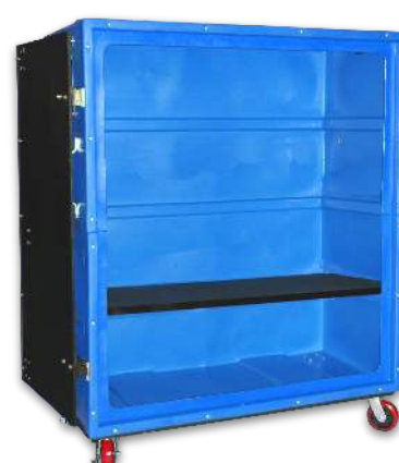
One Lower Shelf With 32" Upper Level and 16" Lower Level