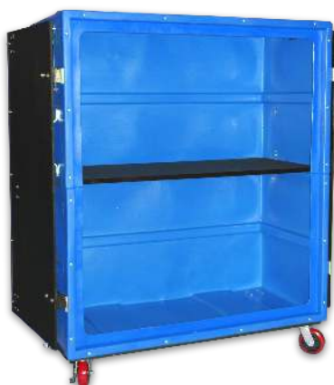
One Centered Shelf With Two 24" Levels