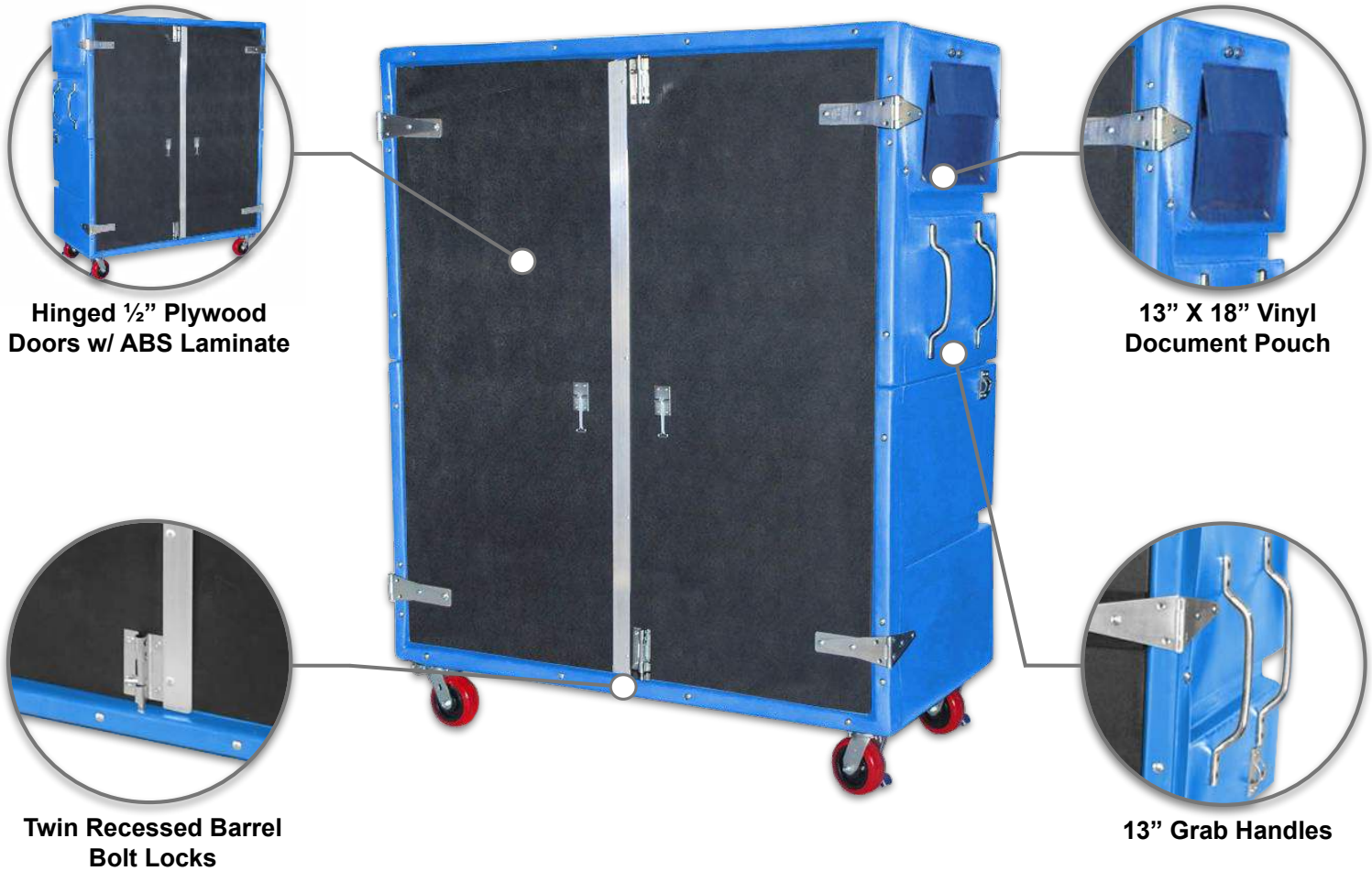
Hinged 1/2" Plywood Doors w/ ABS Laminate