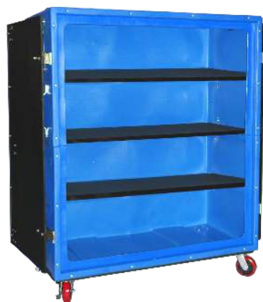
Three Shelves with Four 16" Levels