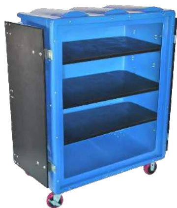
Three Shelves with Four 16" Levels