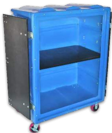
One Centered Shelf With Two 24" Levels