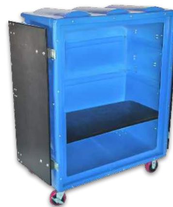
Lower Shelf With 32" Upper Level and 16" Lower Level