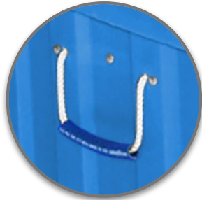
Nylon Rope Handles w/ Rubber Grips