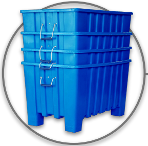
Tapered For Nestability