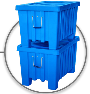
Stackable Up To Three High