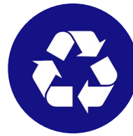
100% recyclable polyethylene supports ESG/green procurement