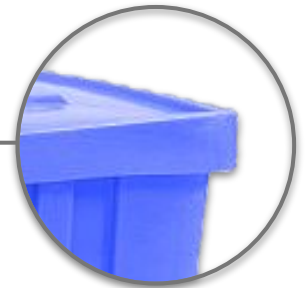
Nylon Rope Handles w/ Rubber Grips