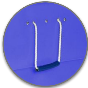
Optional Nylon Rope Handles w/ Rubber Grips