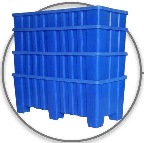
Tapered For Nestability