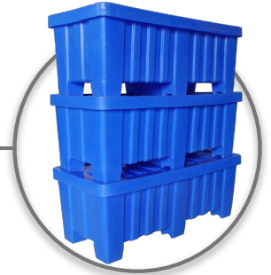
Stackable Up To Two High