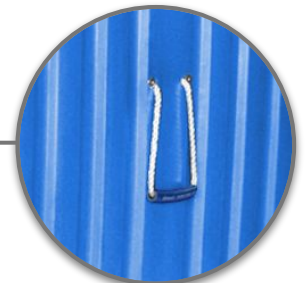
Nylon Rope Handles w/ Rubber Grips