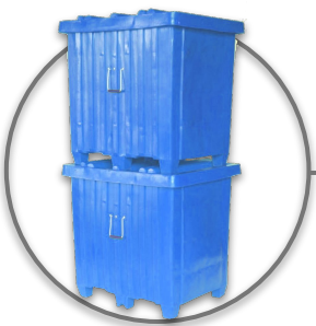
Stackable Up To Two High