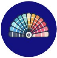
Choice of fourteen colors