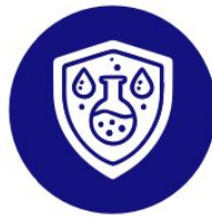
Impact, moisture and chemical resistant material