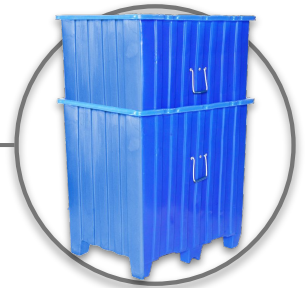
Tapered for Nestability