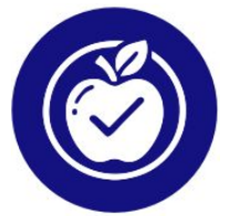
Material complies with FDA for contact with food