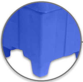
Four Way Forklift Entry