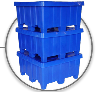
Stackable Up To Three High