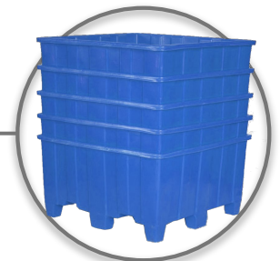
Tapered for Nestability