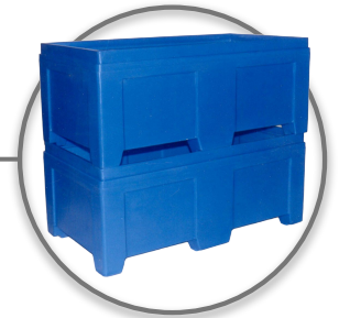
Stackable With or Without Lid