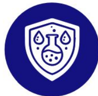
Impact, moisture and chemical resistant material