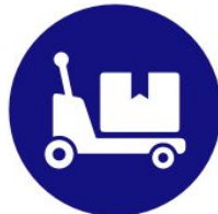
Four-Way Forklift Entry