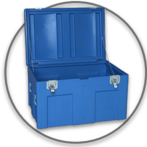
Hinged Lid W/ Stays