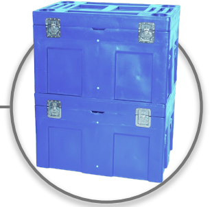
Stackable Up To Three High