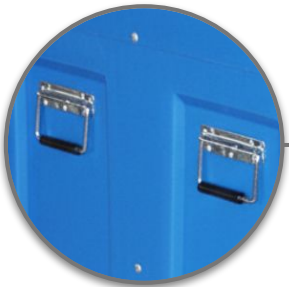
Spring Loaded Surface Chest Handles