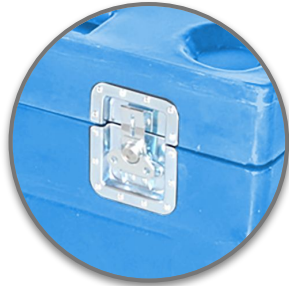
Spring Loaded Surface Chest Handles