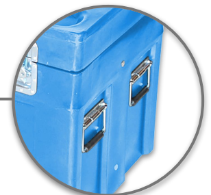
5" Poly on Poly Casters W/ 3/4" Plywood Base