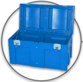
Hinged Lid with Stays