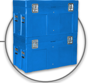
Stackable Up To Three High