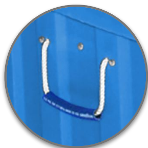
Nylon Rope Handles w/ Rubber Grips