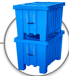
Stackable Up To Three High