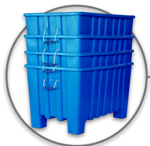
Tapered For Nestability