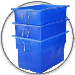
Tapered For Nestability