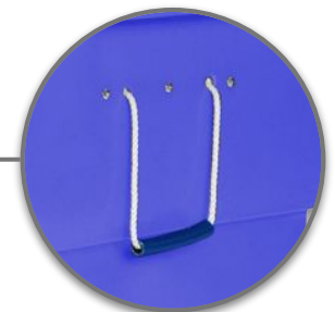
Nylon Rope Handles w/ Rubber Grips