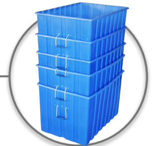
Tapered For Nestability