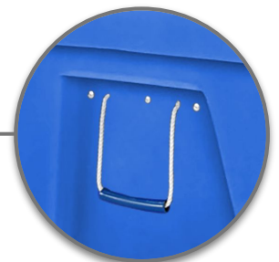
Nylon Rope Handles w/ Rubber Grips