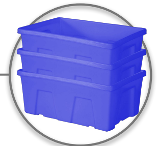
Tapered For Nestability