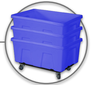
Tapered For Nestability