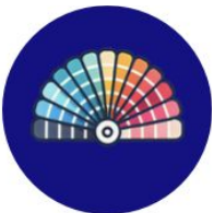
Choice of fourteen colors