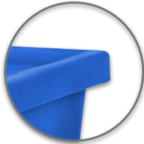
Optional Matching Lid