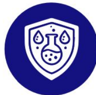
Impact, moisture and chemical resistant material