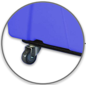
3" Poly on Poly Swivel Casters on 3/4" Plywood Base