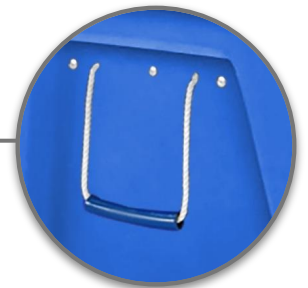
Optional Nylon Rope Handles w/ Rubber Grips